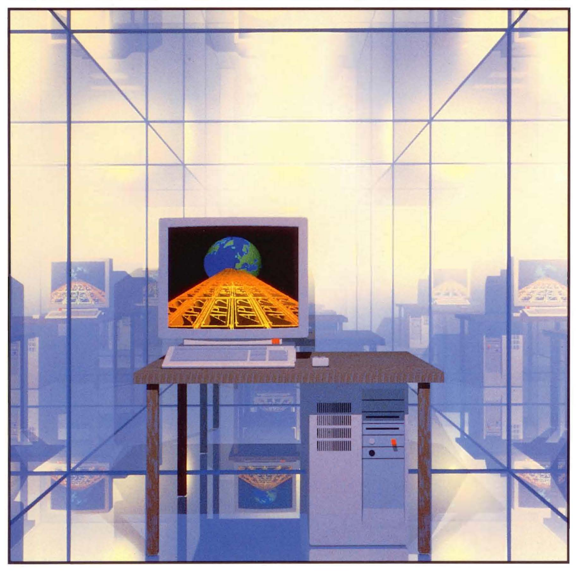
APL2 for the RISC System/6000™